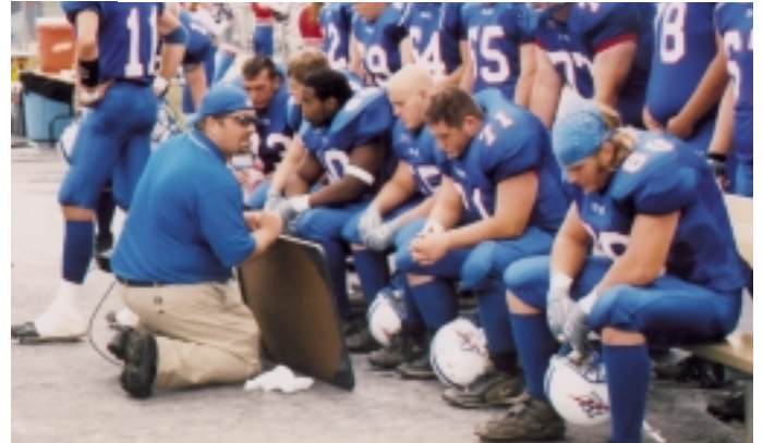
GAME PLAN —The Thunder work on their game plan.