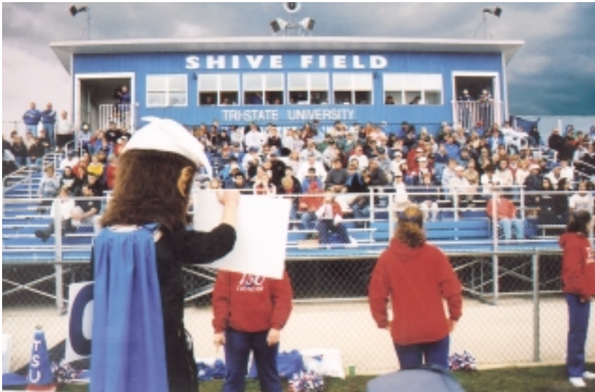
GO THUNDER! —The dark sky during the football game doesn't deter the Thunder faithful.